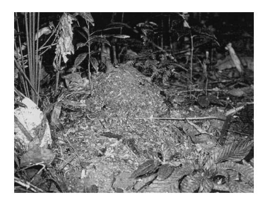
Figure 1. Bombus transversalis nest illustrating the conical shape, canopy characteristics and physical support protruding through the nest (modified from Cameron et al., 1999).

B transversalis moved into rain forest habitat from surrounding temperate areas? Published reports on colonies discovered in the wild all