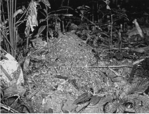
Figure 1. Bombus transversalis nest illustrating the conical shape, canopy characteristics and physical support protruding through the nest (modified from Cameron et al., 1999).

B. transversalis moved into rain forest habitat from surrounding temperate areas? Published reports on colonies discovered in the wild all