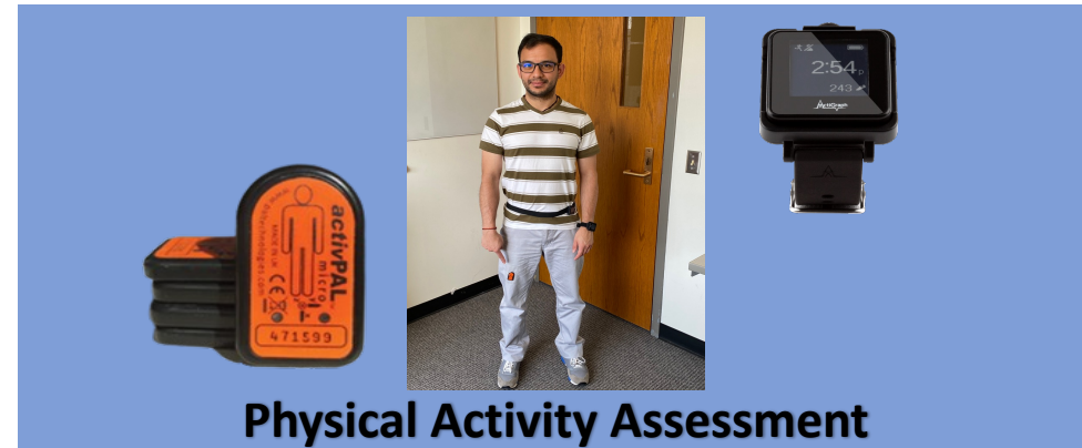
Physical Activity Assessment