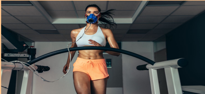
VO 2 max Test