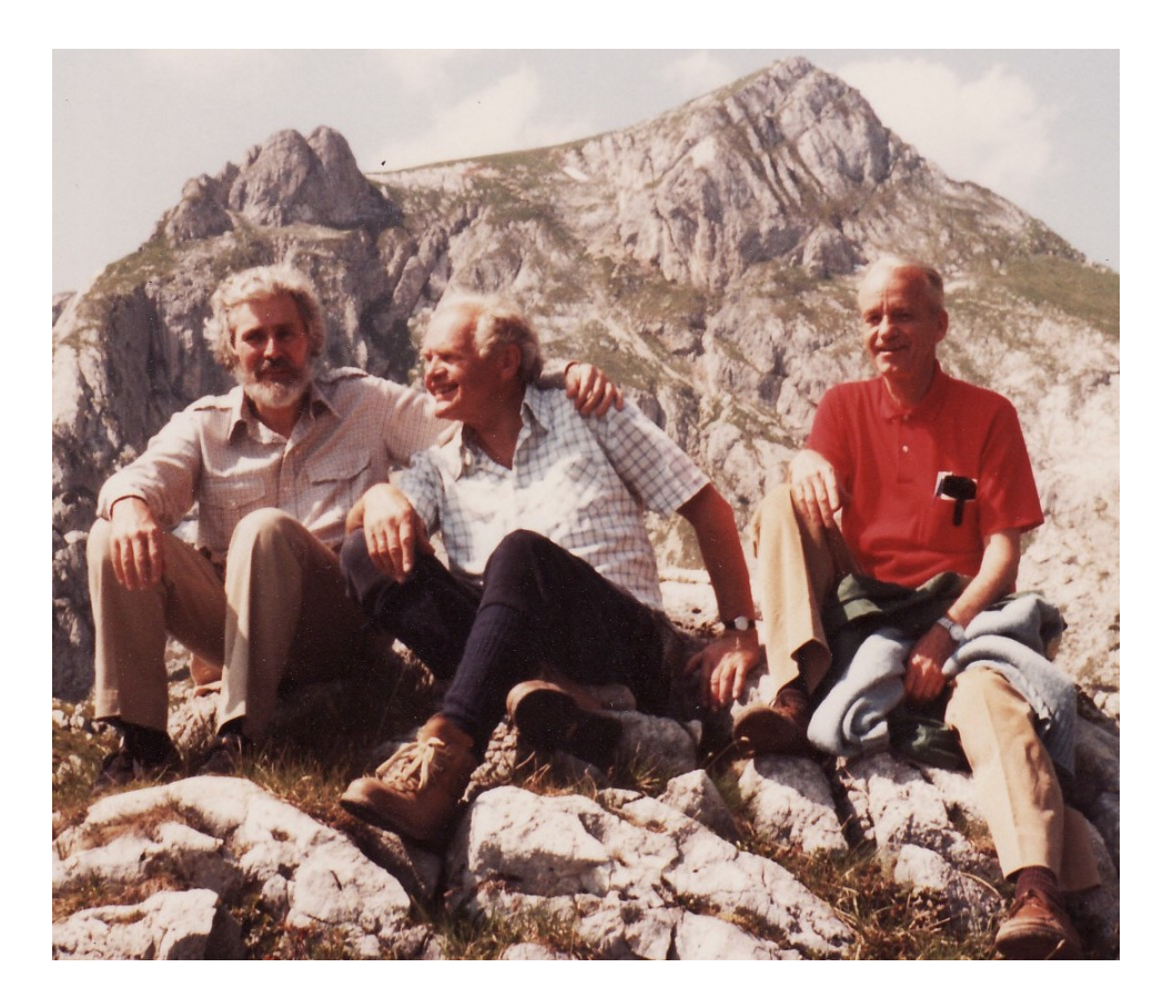
Figure S4. Left to right: Carl Woese, Otto Kandler and Ralph Wolfe (1981; also see Fig. 2 in the main text)