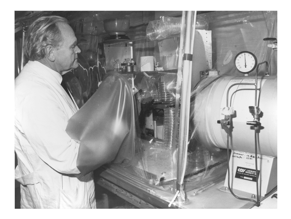
Figure S5. Otto Kandler in his laboratory in Germany (1983)