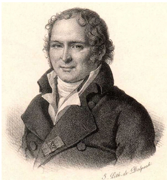
Fig. 2 A portrait of Antoine François de Fourcroy.

quite explicitly has oxygen generated by decomposition of water driven by light, with the reducing power also generated and used to drive synthesis of plant materials, owes a great deal to Lavoisier's work from this period.