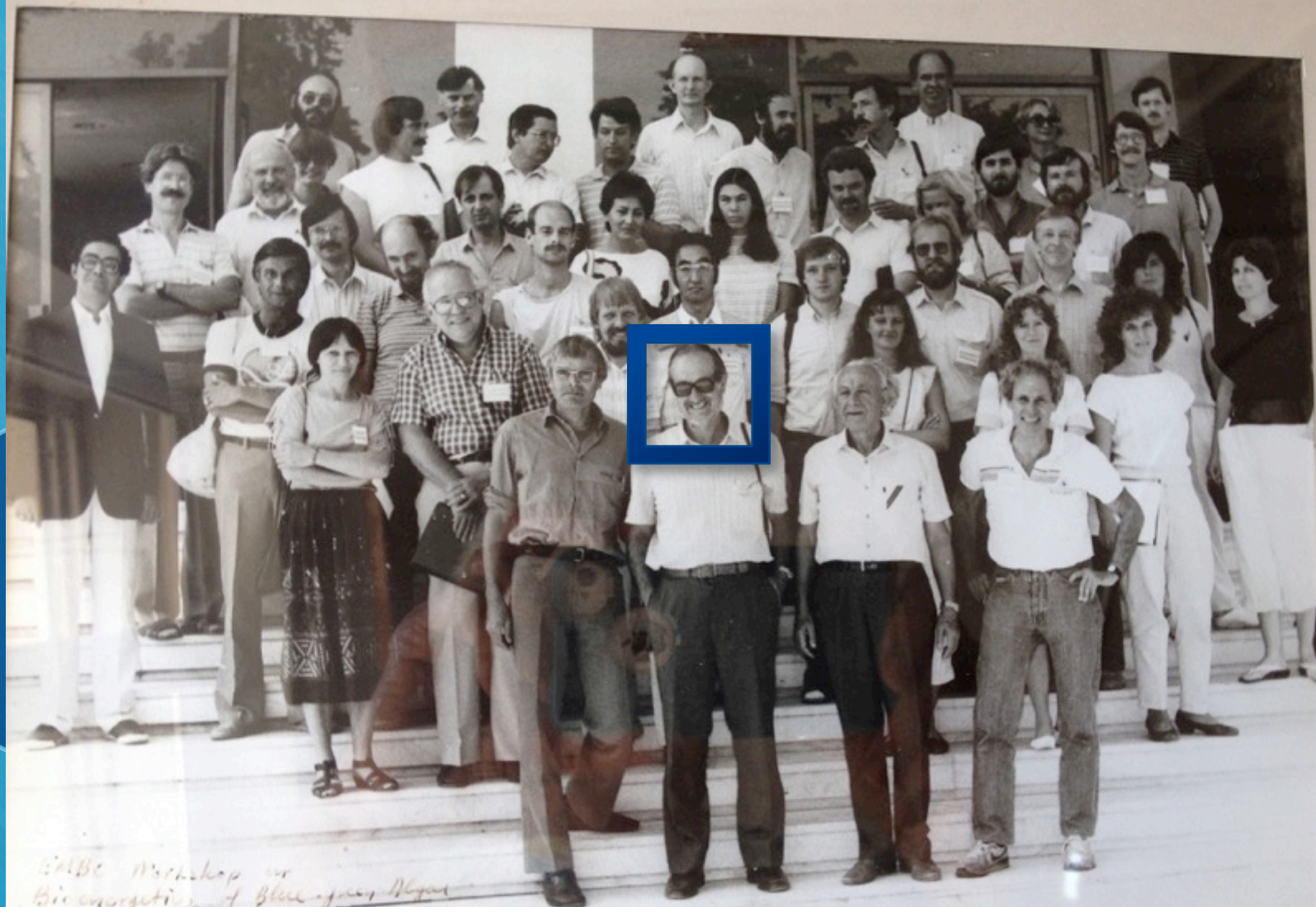
GAAC Workshop on Bioenergetics of Blue-green Algae Cuba Island / Sept 16-21, 1985