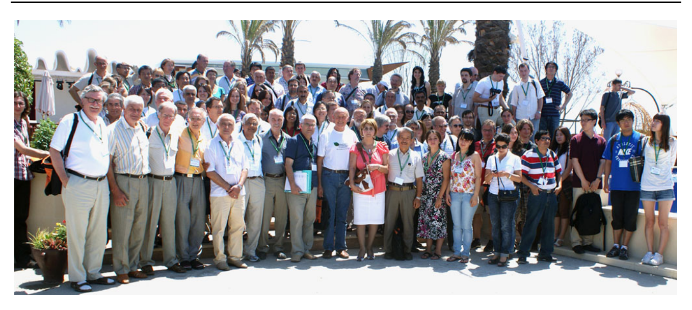
Fig. 3 A group photograph of some of the participants at the conference on the grounds of the Crescent Beach Hotel