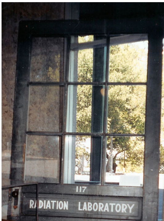
Fig. 11 A photograph of the door, marked 117, from the ORL (Old Radiation Lab), Photo, 2001, at University of California, Berkeley.