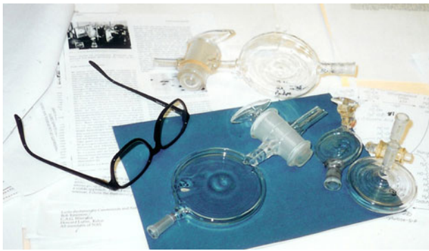
Fig. 6 A photograph of several glass “lollipops” used for putting algal suspensions to which ^{14}\text{CO}_2 was injected and then after illumination, the suspension was let out, by opening the stopcock, into boiling methanol. Photo, 2001.