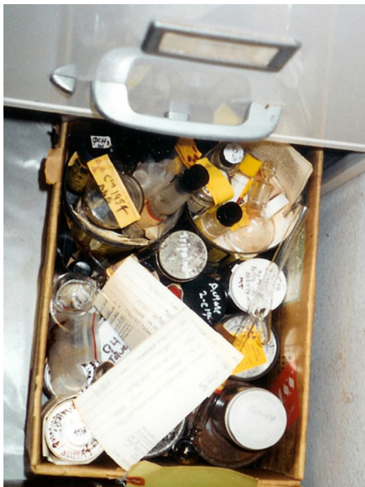
Fig. 10 Chemicals from Andy Benson’s days in the 1950s at UC Berkeley. All the chemicals were still in original containers and they were kept in a cardboard box inside a filing cabinet. Photo, 2001. Source: Govindjee