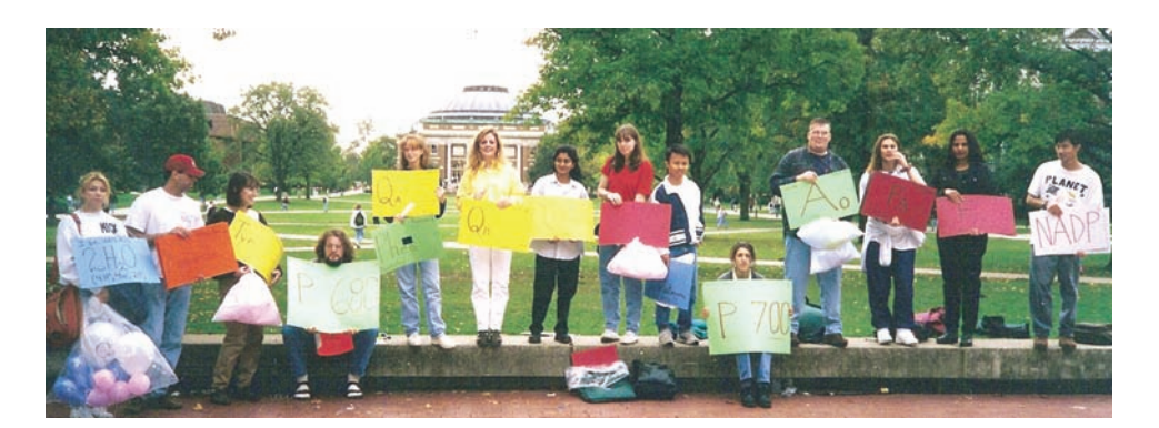
Fig. 1 Undergraduate students, in Govindjee's class, assembled in the Quad of the University of Illinois at Urbana, with names of the molecules they represent, and balloons of different sizes and color, representing electrons, protons, and oxygen atoms. Note that P680 and P700 students are sitting down (ground state) and when they receive photons, they stand up simultaneously to indicate that both PS I and PS II start almost at the same time

In my own lectures, I have used throwing and transfer of tennis balls and different colored balloons from one student to the other to explain the transfer of electrons and protons. The most effective tool I found was to have students volunteer to become specific molecules, both for the excitation energy transfer process and for the electron and proton transfers. In addition, we also had students who volunteered to become inhibitors, e.g., Diuron. These students would learn their chemical structures and their physico-chemical properties from books and/or from me. Then, they would participate in the entire process, with a couple of students acting as photons. We would cover the entire process of water oxidation, NADP reduction and ATP formation (see Fig. 1 of students in my class, ready to act as molecules). We would make sure that the Photosystem I and the Photosystem II reactions started simultaneously, not PS II and then PS I. The entire show was presented either on the stage in a large auditorium or outdoors on the campus. Through this demonstration, students learned the concepts of Antenna and Reaction Centers, of Excitation Energy Transfer, of the Two Light Reactions and Two Pigment Systems, of