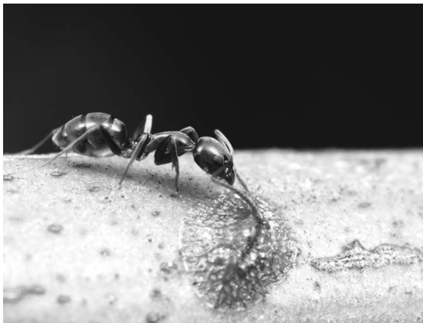
PLATE 1. Argentine ant ( Linepithema humile ) tending scale insects on citrus trees in California, USA.

tolerance to environmental conditions could also affect the extent to which invasive species can invade new environments. The consequences of these changes for the success of Argentine ants in invading new environments remain unknown; clearly, further detailed comparisons between native and introduced populations are necessary.