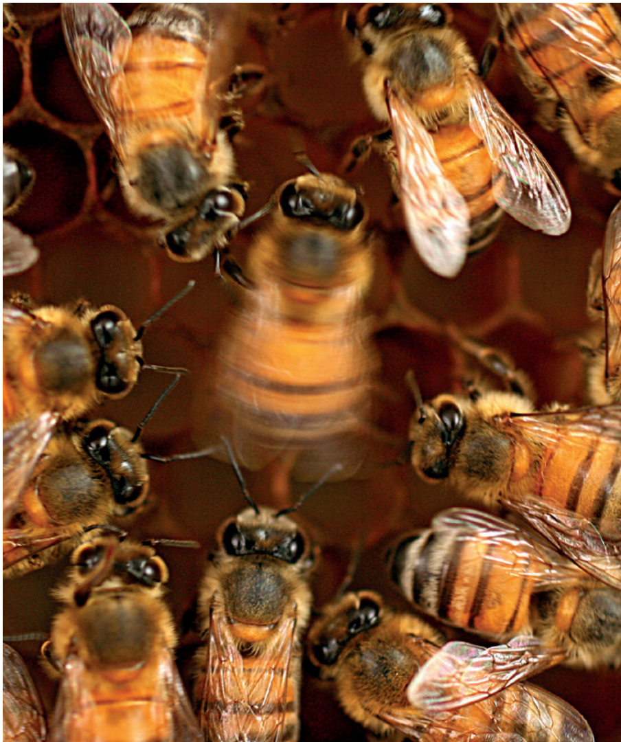
Honeybees use the 'waggle dance' to convey information about the location of a food source to a hive.