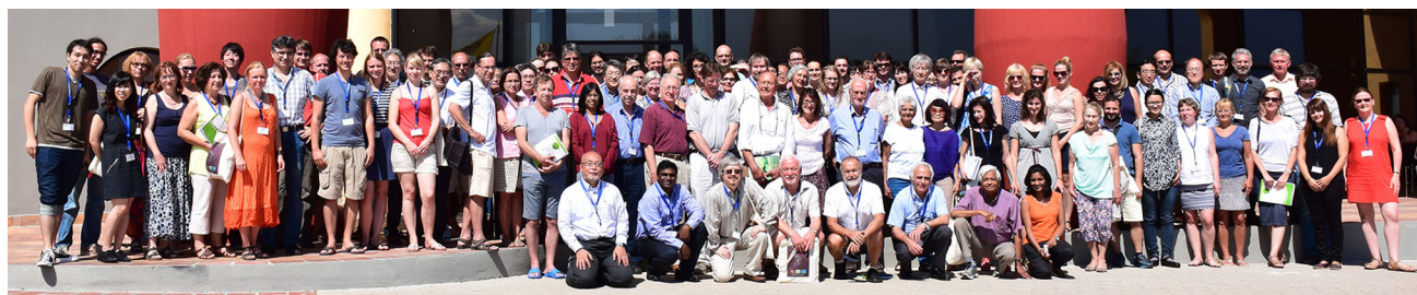
Fig. 1 A group photograph of the participants in front of the conference building.

countries. Figure 1 shows a group photograph of the participants at this conference that was held during September 21–26, 2015 in Crete. It was a great occasion for discussions of molecular to global aspects of research on photosynthesis ( http://photosynthesis2015.cellreg.org/Programme.php ).