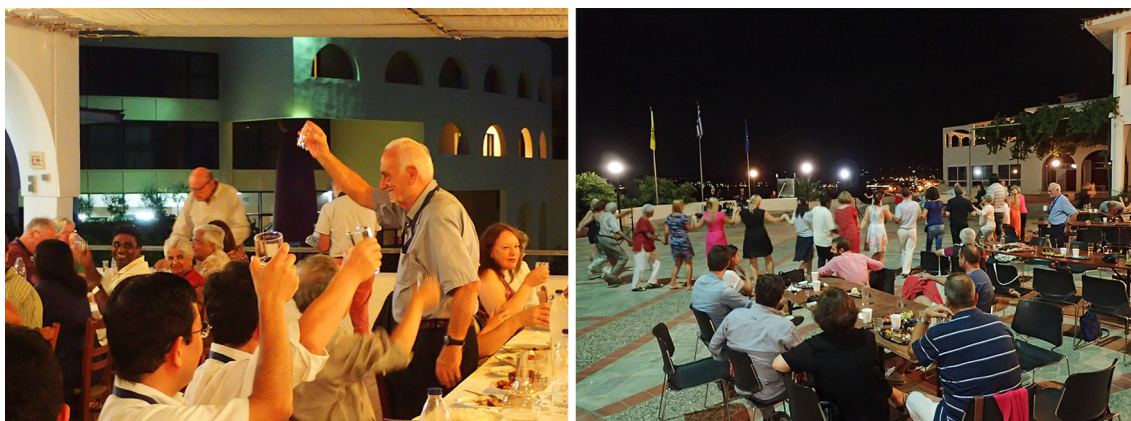
Fig. 5 Left Participants at a dinner party and banquet; Papageorgiou reciprocating the toast given in his honor. Right Participants dancing in celebration of the event.